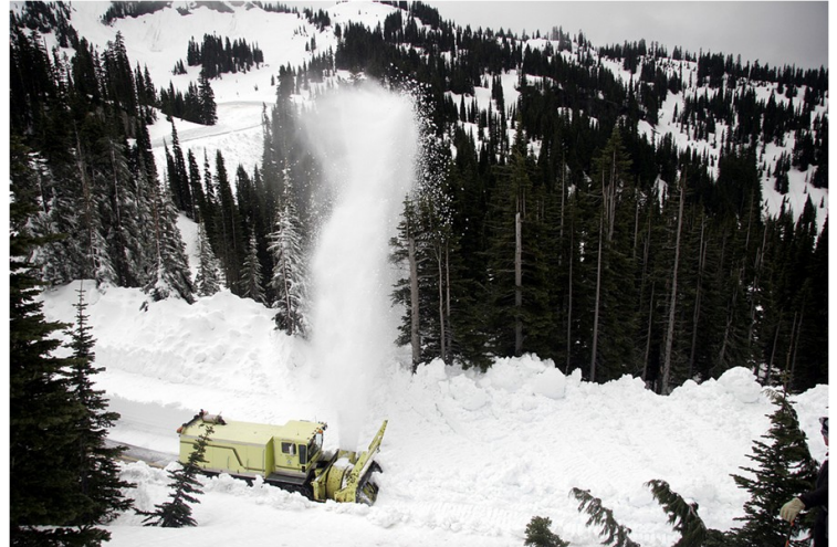
Blower Clearing Snow at Chinook Pass on June 11, 2011.