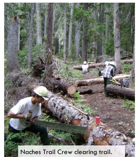
Naches Trail Crew clearing trail.